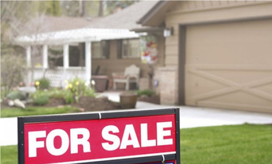
Client Clients Want Real Estate? 8 Things Advisors Should Know