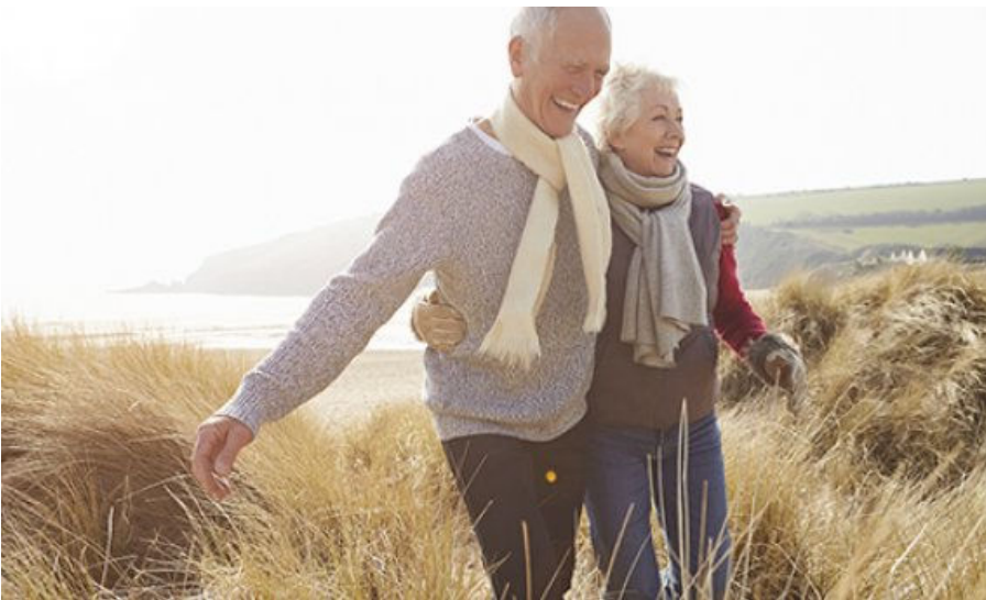
Retirement Planning New Data: What Long-Term Care Costs Now